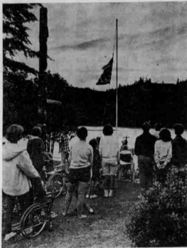
SUNDOWN at Camp Easter Seal, Oregon's only summer camp specially designed for the physically handicapped, finds the youngsters in wheelchairs and on crutches, gathered round for the lowering of the flag. Campers come from all parts of the state to the site on North Lake of Ten Mile lake, near Reedsport.