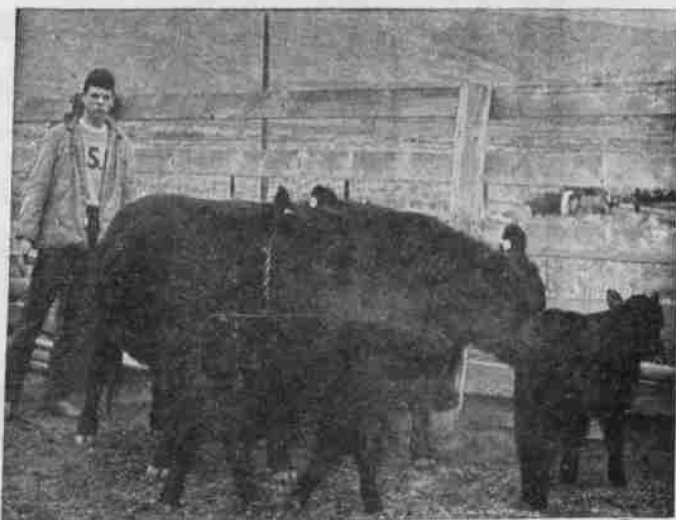
TWO of Monte Evans' Black Angus heifers are shown here with their first calves.