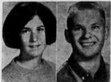
QUEEN SHEILA KING ALFRED