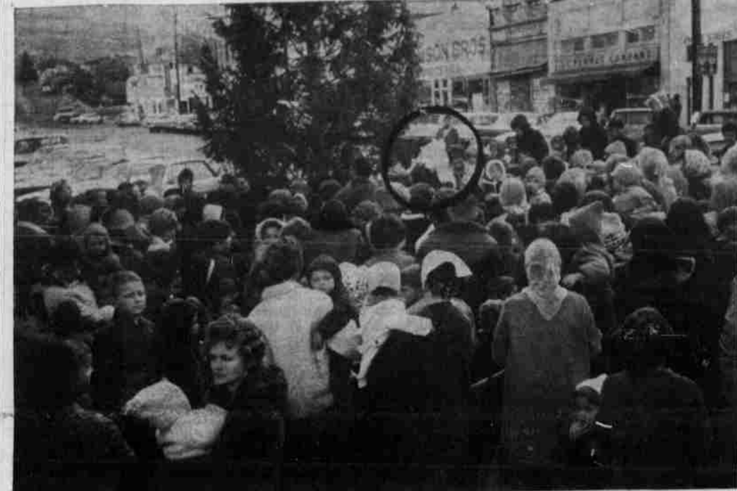
SANTA CLAUS had no sooner arrived on the fire truck Saturday than he was whisked away by the large crowd of children assembled to meet him. Here he is shown (circled) engulfed by the children and mothers of little tots.