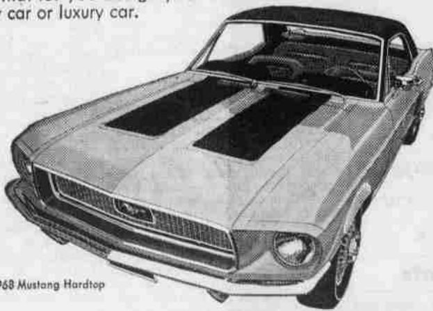
1968 Mustang Hardtop

Mustang, the great original! In three fabulous versions—hardtop, fastback, and convertible. Only Mustang gives you all these standard features: bucket seats, stick shift, new louvered hood with integral turn indicators. Plus options that let you design your own sporty car or luxury car.