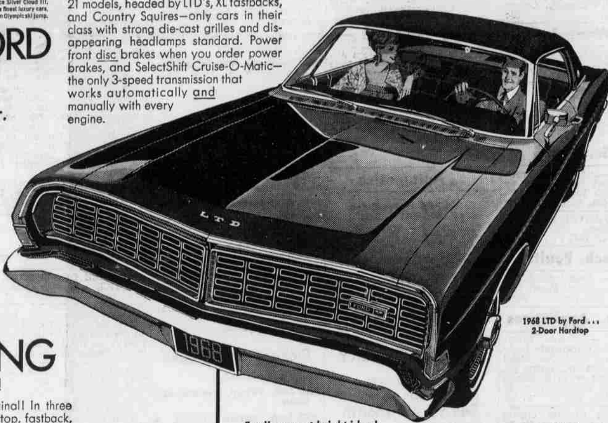
1968 LTD by Ford... 2-Door Hardtop

21 models, headed by LTD's, XL fastbacks, and Country Squires—only cars in their class with strong die-cast grilles and disappearing headlamps standard. Power front disc brakes when you order power brakes, and SelectShift Cruise-O-Matic—the only 3-speed transmission that works automatically and manually with every engine.