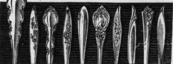
Left to right: Martinique ® , Young Love ® , Grandeur ® , Belle Rose ® , Lasting Spring ® , Stanton Hall ® , First Frost ® , Sentimental ® , Demask Rose ® , Vivant ® .

"Something from the jeweler's, is always something special."