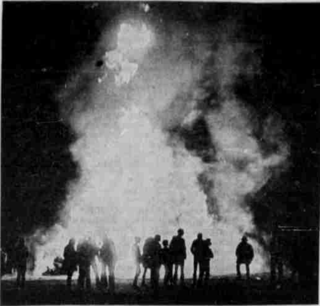
HEPPNER HIGH HOMECOMING BONFIRE