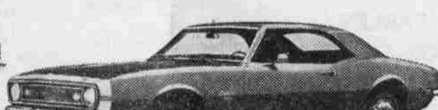
Camaro SS Sport Coupe