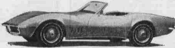
Corvette Sting Ray Convertible

out. You'll appreciate all the proved safety features on the '68 Chevrolets, including the GM-developed energy-absorbing steering column and many new ones. More style. More performance. More all-around value. One look tells you these are for the man who loves driving. One demonstration drive shows why!