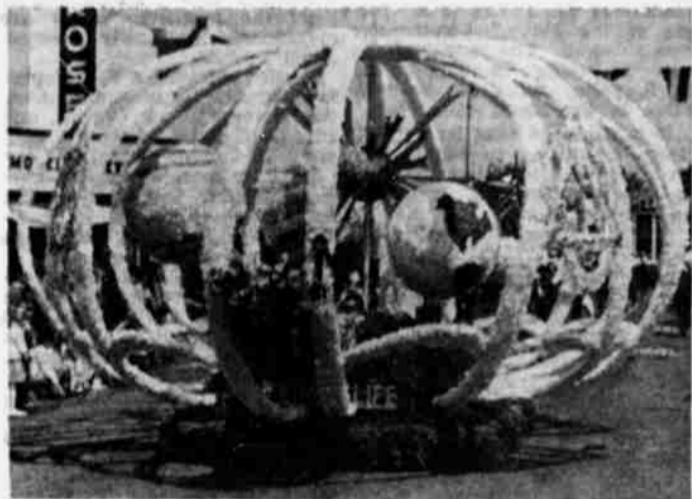
COMMEMORATING the 450th Reformation, this float of Lutheran churches will come from Milton-Freewater for the Grand Rodeo parade here Saturday. Lutheran churches of a wide area contributed to the float which cost some $1250 to build. It has been a top prize winner in many parades.