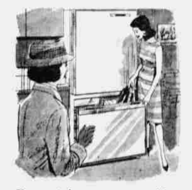
Unexpected guests are no problem when there's a freezer filled with good food. It's almost like having a supermarket in your own home!

Save money by "freezing" your garden's surplus fruits and vegetables. Easy with an electric freezer; not messy like old-fashioned canning methods.