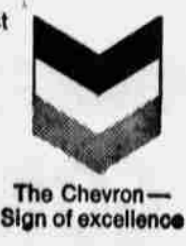
The Chevron—Sign of excellence

Standard Oil Company of California and its worldwide family of Chevron Companies