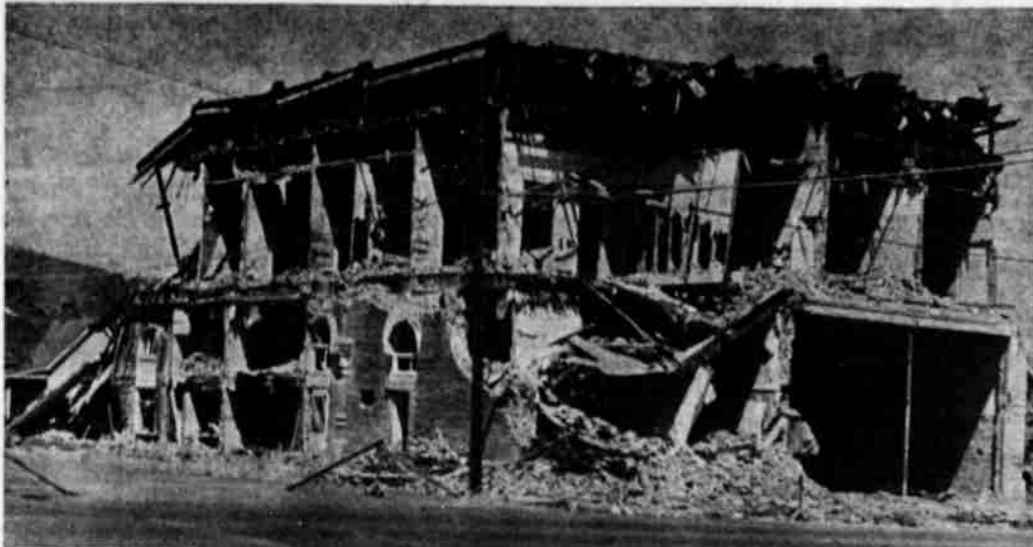
EXPOSED AND BATTERED, the old structure was humbled by the wreckers and presented this picture by late last week. By Tuesday night of this week, the structure was reduced to a heap of debris. (G-T Photo).