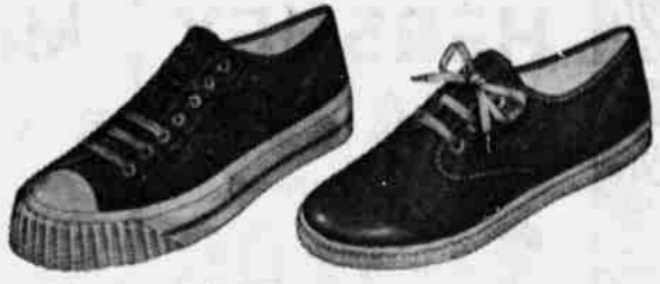
MEN'S AND BOYS' LOW-CUT OXFORD, REG. 3.99