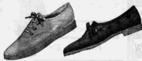
WOMEN'S AND GIRLS' SNUB-TOE OXFORD, REG. 2.99