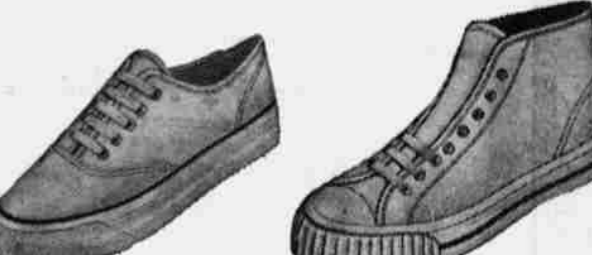
MEN'S AND BOYS' BOAT SHOE, REG. 4.99