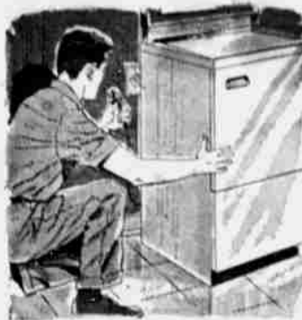
220 VOLT OUTLETS cost little extra if installed as you build. Then you can enjoy an electric range, clothes dryer and other wonderful appliances.