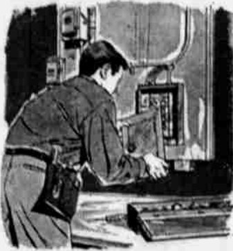
ENTRANCE PANEL (fuse box) must be large enough for your ever-increasing need for more electricity. Inadequate panels can cause trouble.