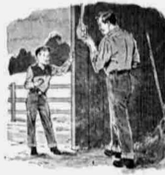
SHOPS AND other buildings are more productive with electrical power. Well placed electric motors do many jobs; lights add hours to work days.

We'll gladly make a free "Power Survey" of your home.