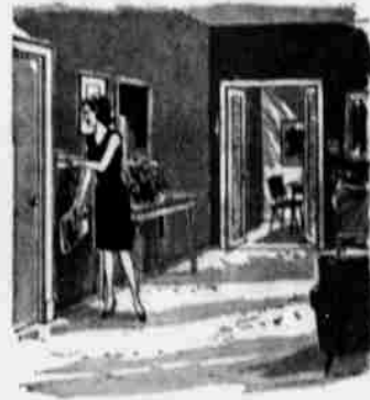
HANDY SWITCHES save steps and prevent accidents caused by groping in dark rooms. Install 3-way switches near every entrance to all rooms.