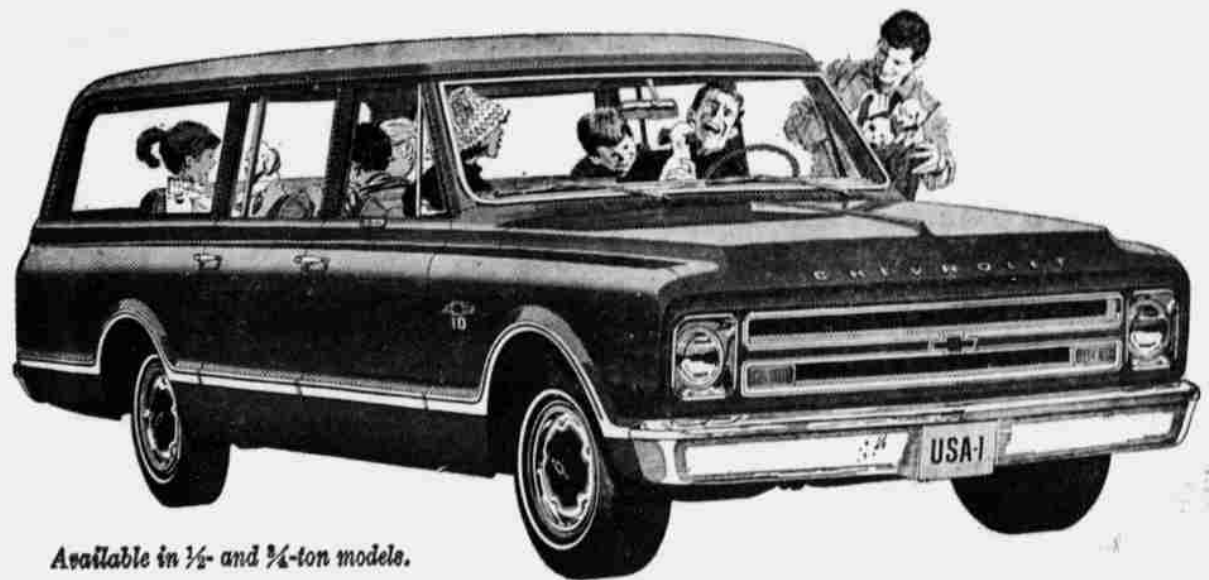
Available in 1/2- and 3/4-ton models.

The look, the ride of a station wagon, plus a tough truck chassis!