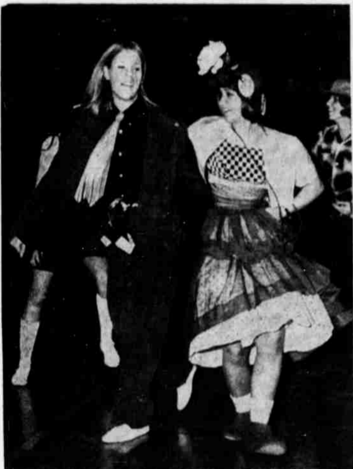
COLORFUL HALFTIME shows have been enjoyed by Heppner High school basketball fans at games during the season just ended...