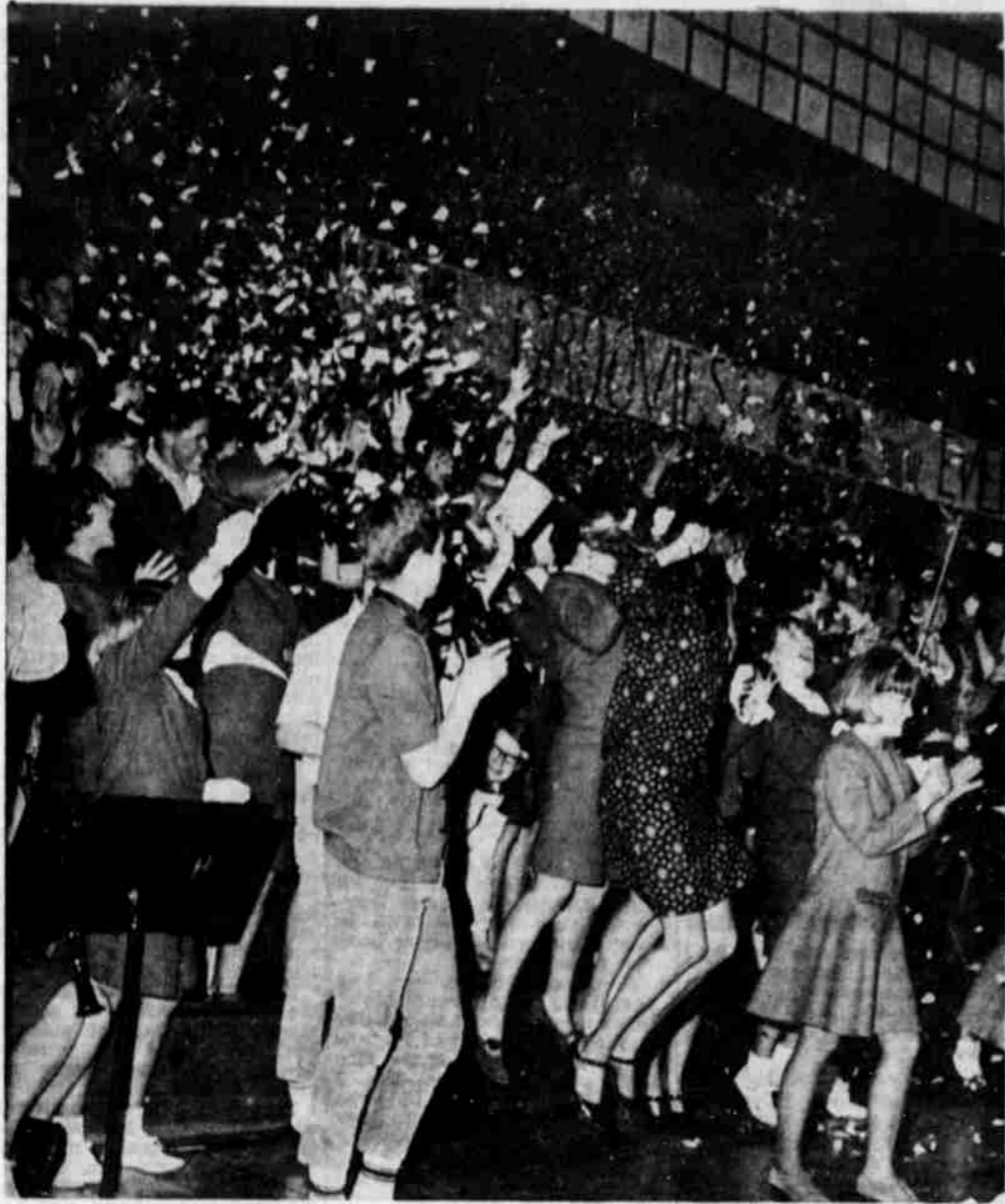
YIPPEE AND HALLELUJAH! This was the gleeful scene in the Heppner High gym Friday night when the Mustangs topped Sherman County, 52 to 45, to gain a first place tie once more with the Huskies. The victory also assured a spot for the Mustangs in the district tournament at La Grande March 3 and 4. Shown in an impromptu victory celebration are Heppner High rooters.