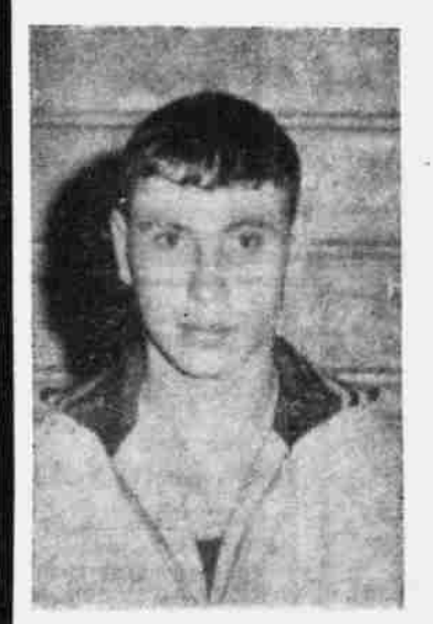
No. 14 Junior 6'1"