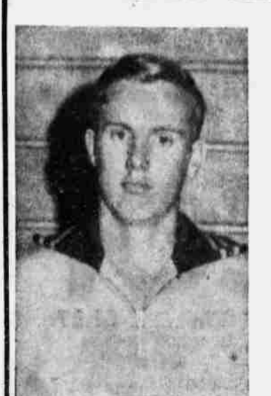
Guard No. 44 Soph. 6'0"