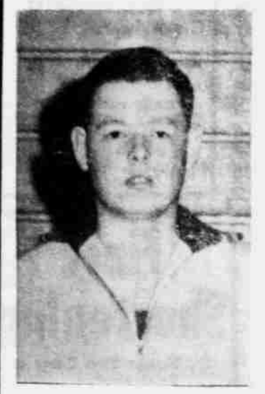
Forward No. 42 Senior 6'1"