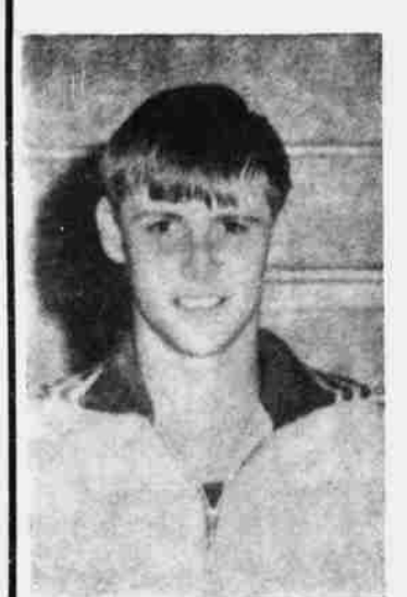
Guard No. 10 Junior 5'10"