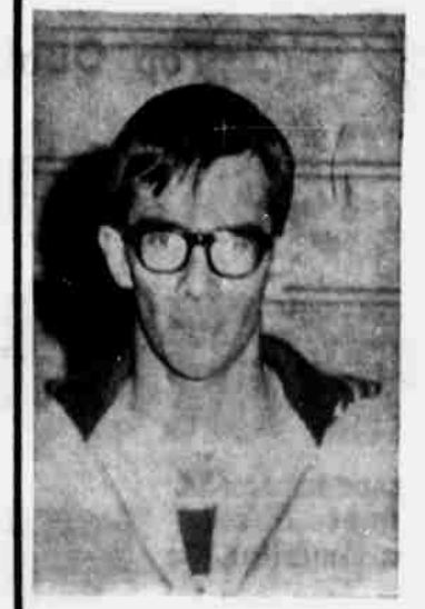
Center No. 22 Senior 6'3"