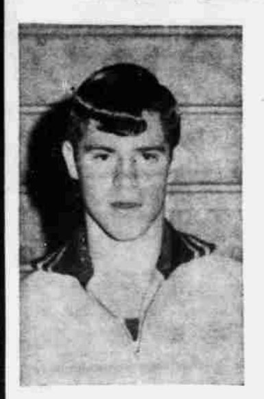
Guard No. 20 Junior 5'9"