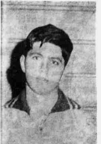
Forward No. 40 Junior 6'3"