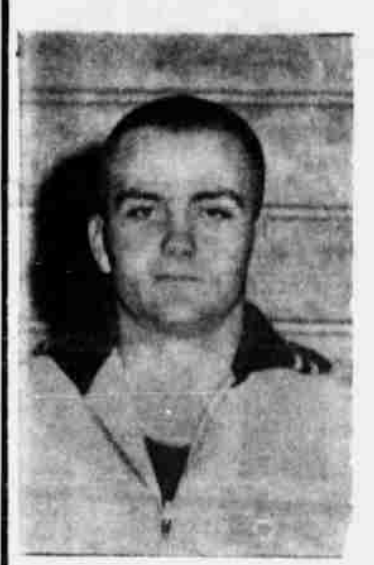
Forward No. 32 Senior 6'1"