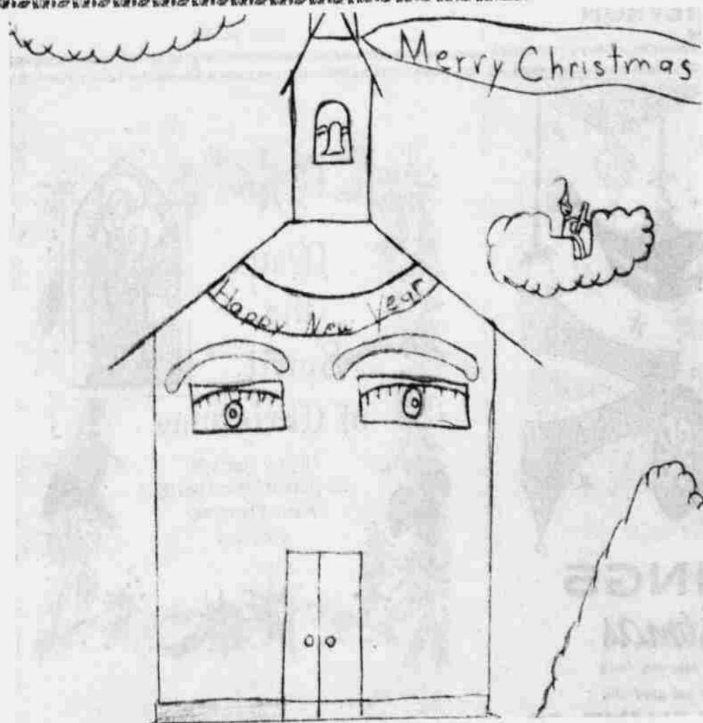
DRAWN BY JAMES CUTSFORTH, 6th GRADE FARLEY MOTOR CO.