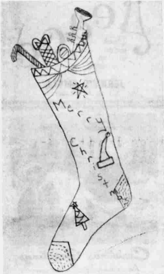
DRAWN BY MELINDA LEONNIG, 7th GRADE VAN'S VARIETY