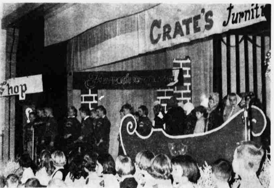
HEPPNER "PONIES" pull a sleighful of girls singing "Sleigh Bells" in this scene at the Heppner Elementary Christmas program. Fourth graders presented this portion. The entire staff of teachers at the school had a share in staging the program, "Christmas Windows."