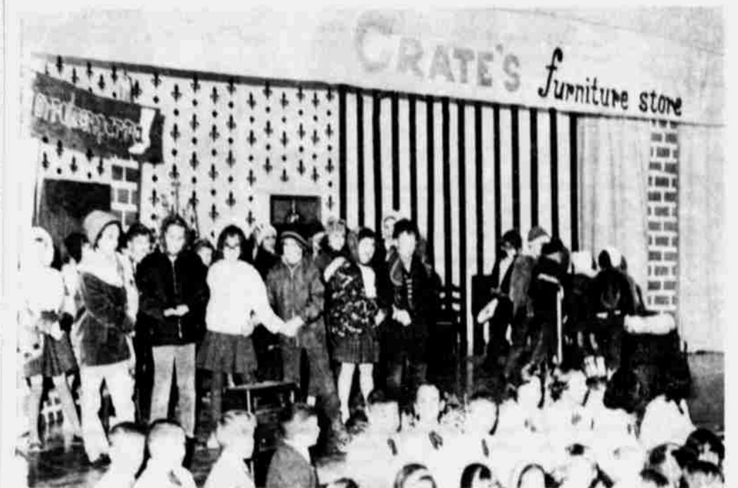
THE 'SIDEWALK' in front of "Crate's Furniture Store" was the setting for the Skater's Waltz, performed by third graders in the Heppner Elementary program Tuesday night, December 13. The group at the left has just finished the waltz while the group at the right is doing a special dance. The 'sidewalk' was actually the stage in the junior high gym.

Gazette-Times Photos, Engravings Processed on G-T's New Fairchild Cadet Photo-Engraver.