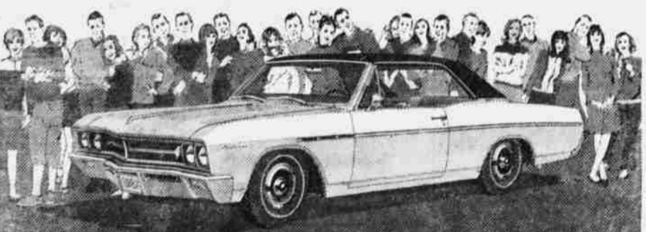
'67 Special Deluxe. Let its low price talk to you.

IN '67 BUICK Get in with the In Crowd at your Quality Buick dealer's now.