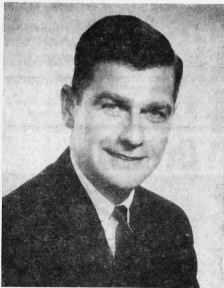
MARK HATFIELD For U. S. Senator

The strength and benefits of this nation's two-party system can best be attained by electing more Republicans to represent us in Washington, D. C.