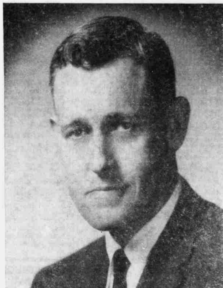
TOM McCALL For Governor

Outstanding Secretary of State giving trusted and independent leadership.