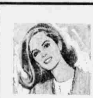
Your kind of shoe

colored slides of his four dur-ing the program, starting at 7:30 p.m. The business meeting will follow the program. Regular grange meeting on October 14 was postponed, due to the death of one of its mem-bers, Raymond Drake.