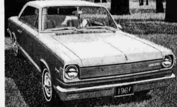
RAMBLER AMERICAN Now—Typhoon V-8 thunder comes to the low-priced economy chump. Two Typhoon V-8s; three big 6's. America's only complete line of compacts. Rogue hardtop (above), convertible; 440 sedans, hardtop, wagon; 220 sedans, wagon.