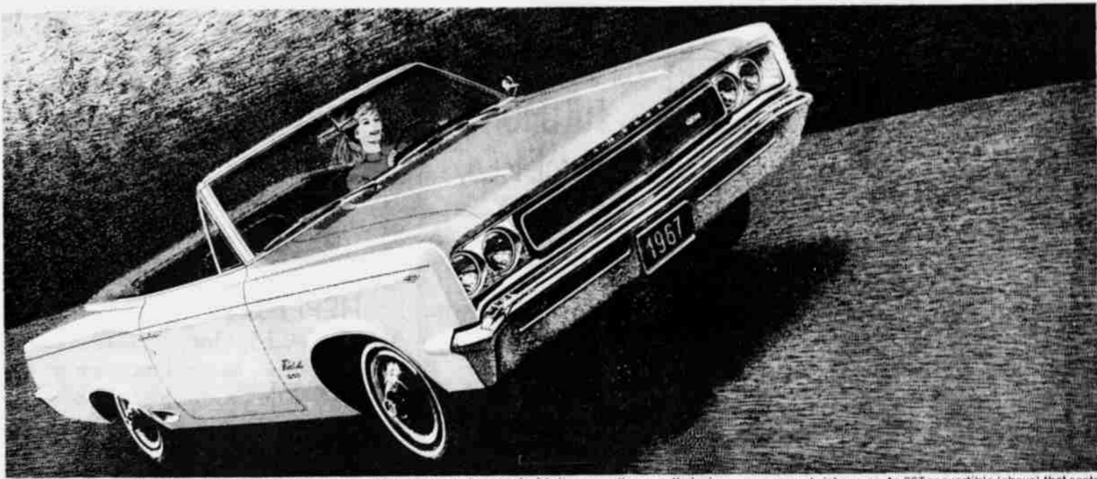
REBEL Now—the first Excitement Machines in the intermediate class! Cars for Now that never existed before! A 114" wheelbase. Excitement that's 197" long, 78" wide, 54" high. More people-space inside than any other cars their size. A choice of five engines, topped by a 343 cu. in. Typhoon V-8. A wide road stance and 4-link rear suspension to glue down corners, untwist curves. An SST convertible (above) that seats 3 in back comfortably. Rebel: SST hardtop and SST convertible; 770 hardtop, sedan, wagon; 550 sedans, wagon.