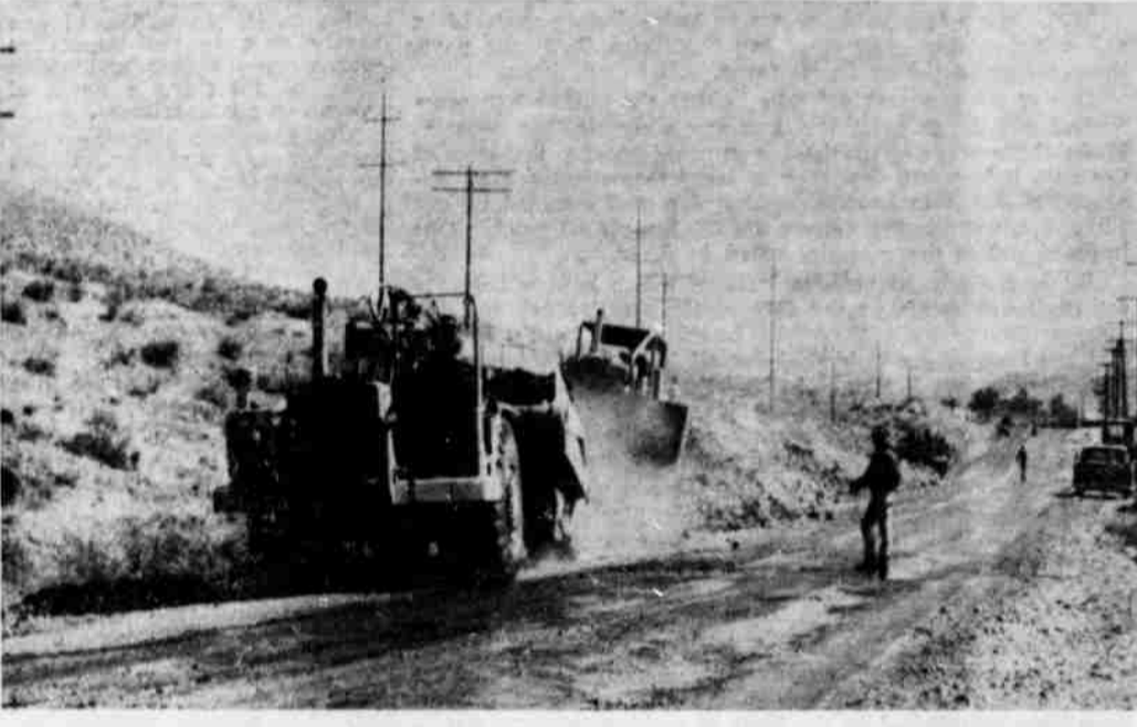
WORK WAS UNDERWAY at full tilt pace this week by E. H. Itschner and Company of Molalla on the job of improving a stretch of Highway 74 from Heppner to a point 2.84 miles north under contract to the State Highway Commission. Top photo shows rock crusher set up near the project and bottom shows heavy equipment engaged in straightening a curve. Other equipment at other points is visible in the background. The company submitted a bid of $233,255 on the project at the July 28 commission meeting. Two 12 foot lanes of highway will be provided and the stretch will be straightened and grades improved. The highway department called for completion of the job in 80 calendar days. Columbia Basin Electric power lines are being moved away from the highway to allow room for the improvement project.