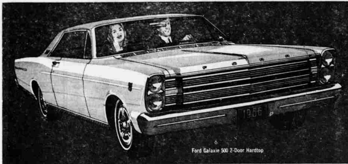
Ford Galaxie 500 2-Door Hardtop

Now! Ford Galaxie 500 Hardtops and Convertibles include whitewalls, special trim, sporty wheel covers and more—all included in the low Sports Sale price. Choice of color! Special savings on Galaxie Cruise-O-Matic, too!