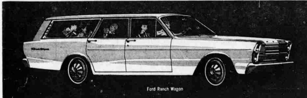
Ford Ranch Wagon

"Sports Edition" Ford Ranch Wagons come with 2-way Magic Doorgate, wheel covers, whitewalls, special luxury trim and more—for less! Sports Sale savings on Fairlane Hardtops and Convertibles, too!