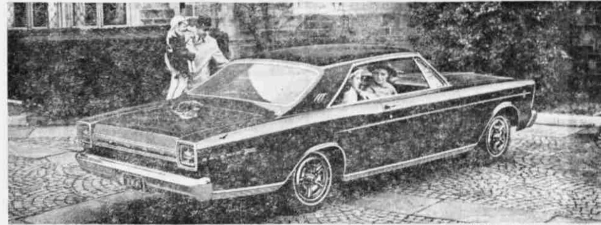
FORD GALAXIE 500 2-DOOR HARDTOP