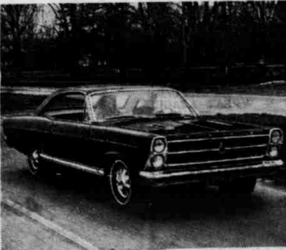
FAIRLANE GT HARDTOP

And booming sales prove it! More and more people are switching to Ford every day...and no wonder. Fords do things other cars can't. You can have a radio in any car, but Ford offers a Stereo-Sonic Tape Player option that turns your car into a concert hall with music of your choice. Most station wagons have a one-way tailgate, but Ford's Magic Doorgate swings out like a door for people and down like a tailgate for cargo. Most cars offer a choice between manual and automatic shift, but Fairlane's GT/A Sport Shift works both ways. Visit your Ford Dealer and test-drive a '66 from Ford.