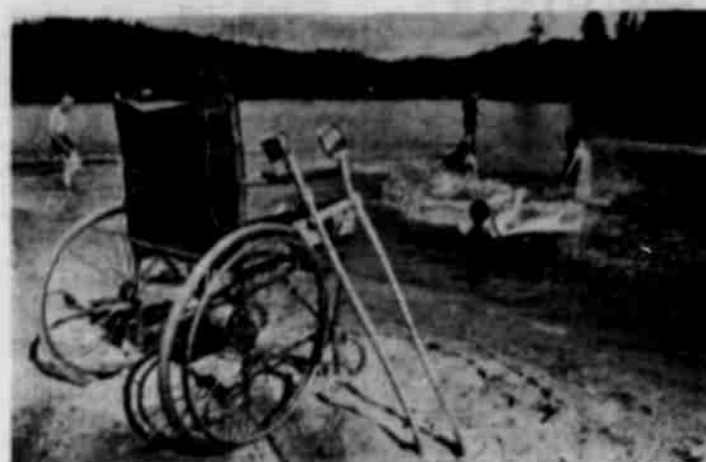
UNIQUE OPPORTUNITY offered by Camp Easter Seal, Oregon's only summer camp exclusively designed for crippled children and young adults, is dramatized by an empty wheelchair on the beach, left there by a young occupant who is enjoying a swim. Camp is located on Ten Mile lake in Coos County.