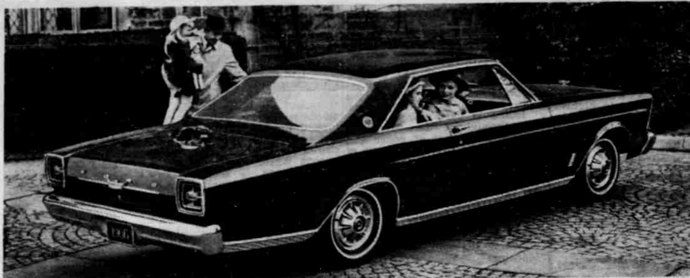
Ford's quiet ride whispers it...