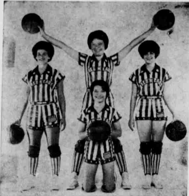
Red Heads—T-Formation All American Red Heads World Champion Basketball Team