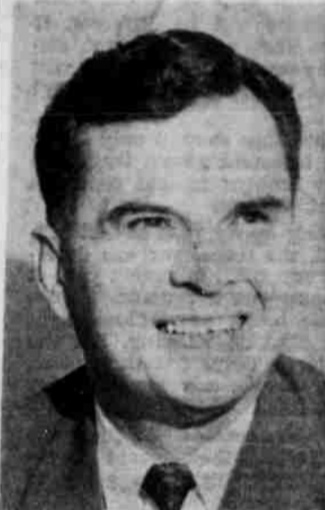
CONG. AL ULLMAN

Madras has the Grant Union-Burns trip ahead of it, as does Sherman. It is conceivable that the league could wind up its regular season with ties for first, second, or third perhaps a combination of ties for any two of the top three rankings.