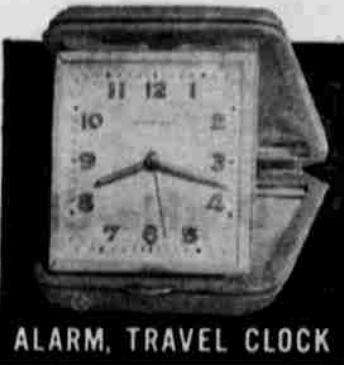
ALARM, TRAVEL CLOCK

A superb value at this low price—made possible by the combined buying power of 561 Jewel House stores. Excellent German-made movement with alarm and luminous dial. Simulated leather case with brass edging in three attractive colors—Tan, Brown and Red.