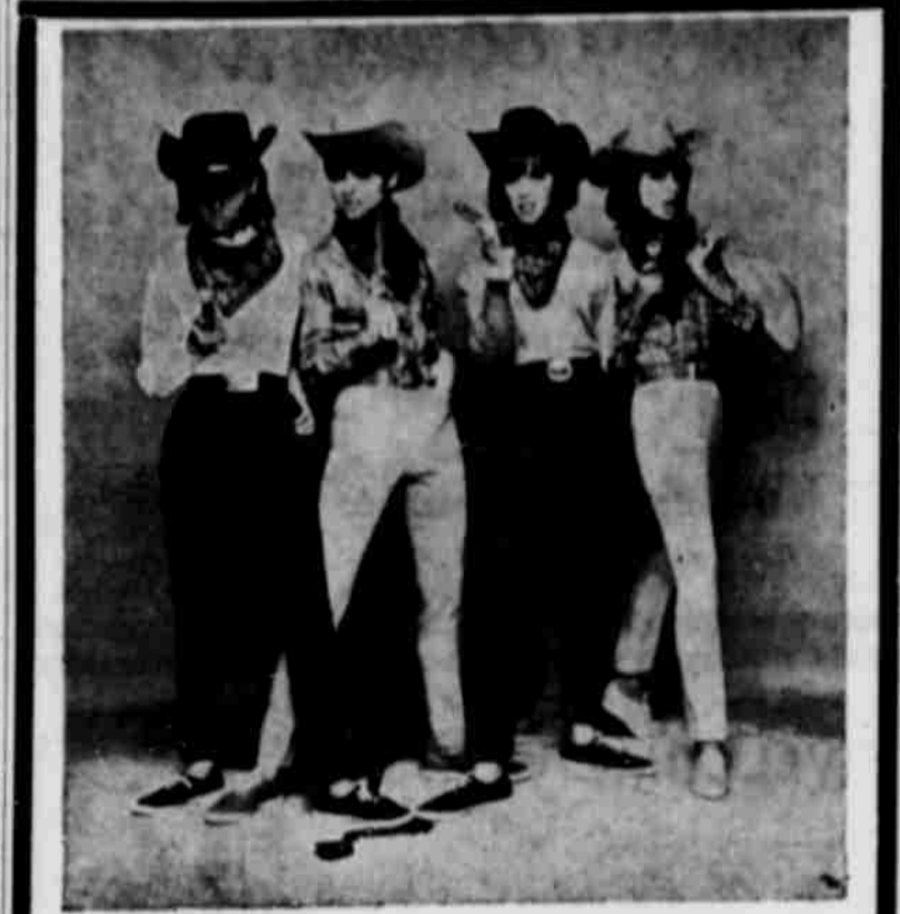
"Okay, everybody . . . stretch!"