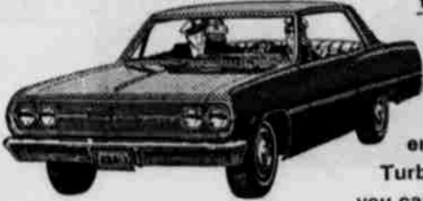
Chevelle Malibu Sport Coupe

FUN CAR: CORVAIR. What sporty style it is: every Corvair coupe or sedan's a hardtop now. And what sport driving a Corvair: four-wheel independent suspension; rear-engine traction; easy steering; up to 180 Turbo-Charged horsepower in Corsas if you order it. Just leave it to Chevrolet to make sure Corvairs look like they cost a lot. Leave it to your Chevrolet dealer to make sure they don't.