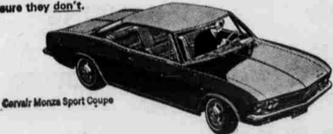
Corvair Monza Sport Coupe

to make sure you get just the Chevelle for you—the model and the body style and the color and the equipment—see your Chevrolet dealer soon. Hurry!