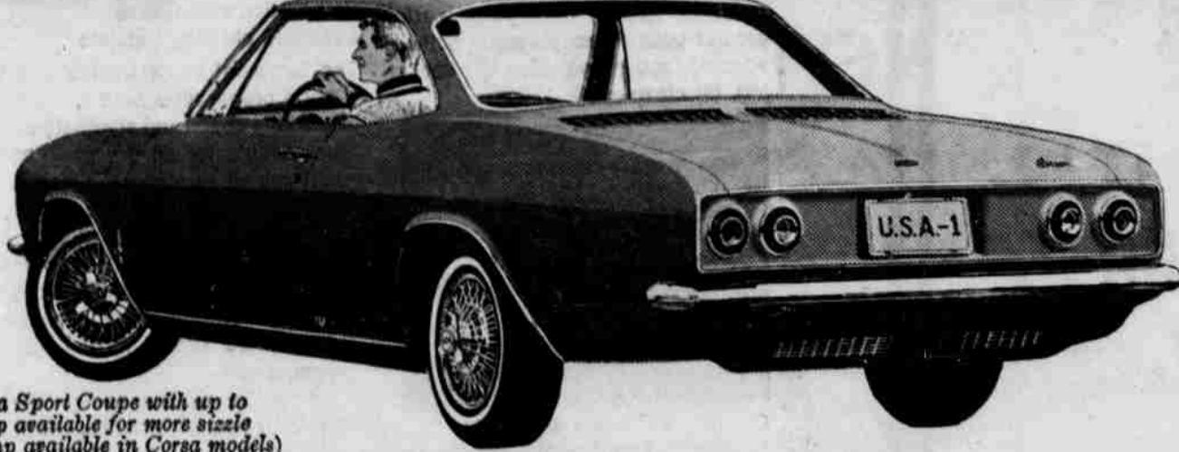
Monza Sport Coupe with up to 140 hp available for more sizes (180 hp available in Corsa models)