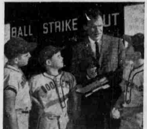
Chevron Dealers are active in civic affairs too. Some are mayors of their towns. Many are leaders in youth organizations, school boards and other community activities.

That's why you find Chevron Dealers so friendly, dependable and eager to please.