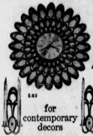
for contemporary decors

Only ELGIN Harmonizes so beautifully in every decorating theme