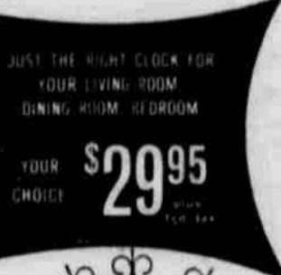
for Spanish decors

This stunning and intricate design captures complements. Rich gold-finished Elwood, spun brass dial with harmonizing center, brass hands. Also available in Mediterranean Black. Matching Sconces $16.95 pr.