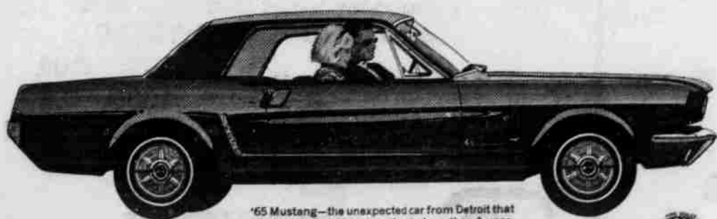
'65 Mustang—the unexpected car from Detroit that climbed to 3rd place in sales in less than 1 year.

'65...best year yet to go see a Ford Dealer HEPPNER AUTO SALES, Inc.