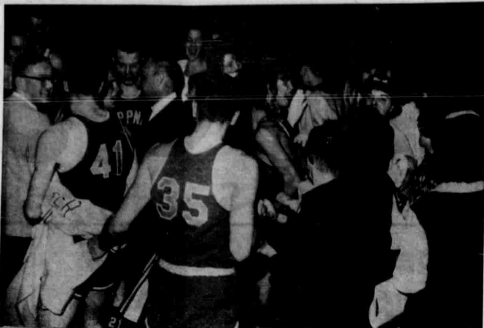
SCENE WAS TUMULTUOUS immediately after the championship game, won by Heppner, at the district basketball tournament, La Grande, Saturday night. Hilarious students crowd around the team and coach to offer congratulations for their victory over Grant Union of John Day. Among team personnel visible

Heppner had outstanding support at the game with several hundred fans backing them. Pilot Rock's rooters, though disappointed at the Friday night loss, came back to support the