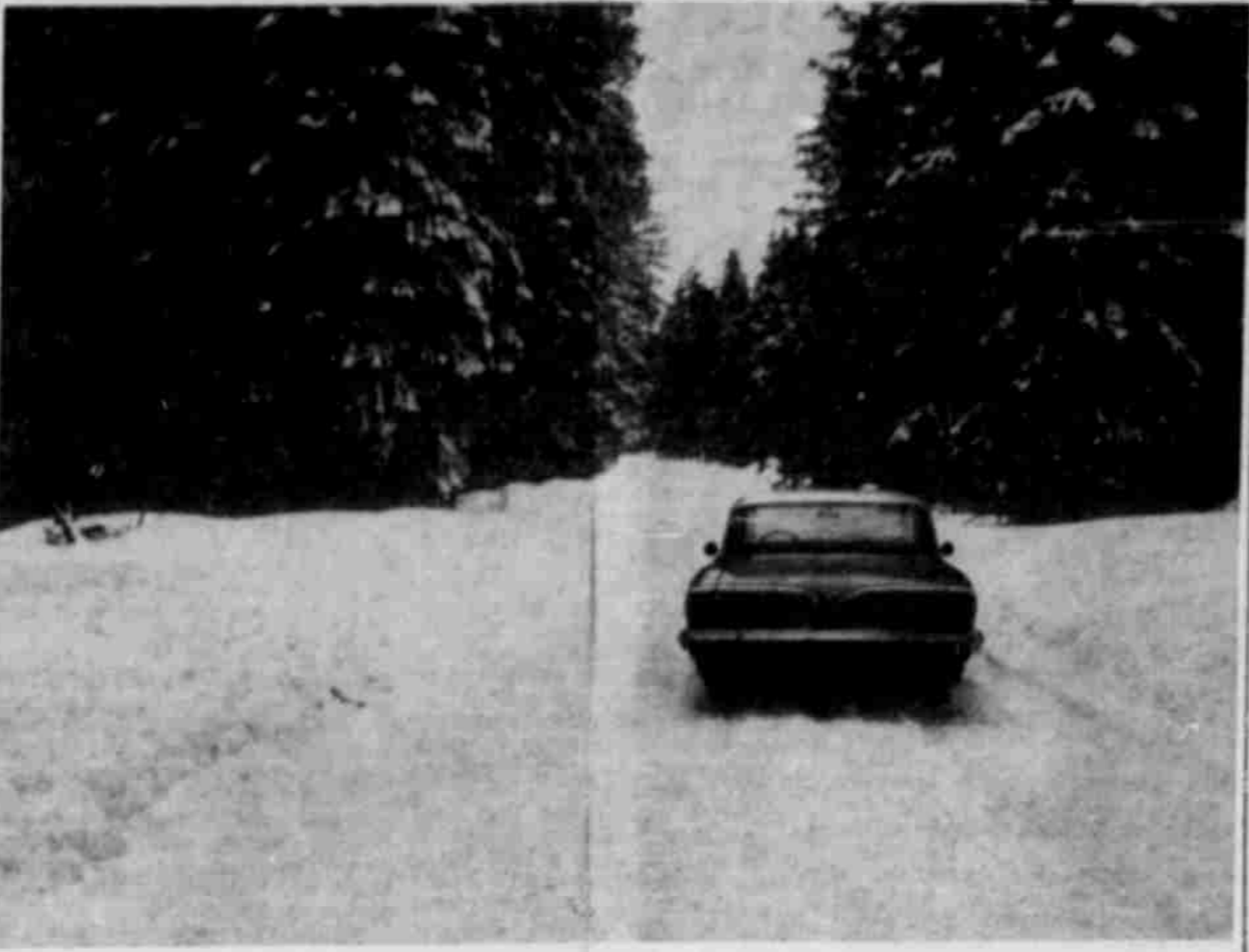
SPRING MAY be just around the corner in Heppner, but its still winter in the mountains. This is the scene on the road to Arbuckle Mountain Ski area.

Heppner, Oregon, Thursday, February 25, 1965 Sec. 4 — 4 pages