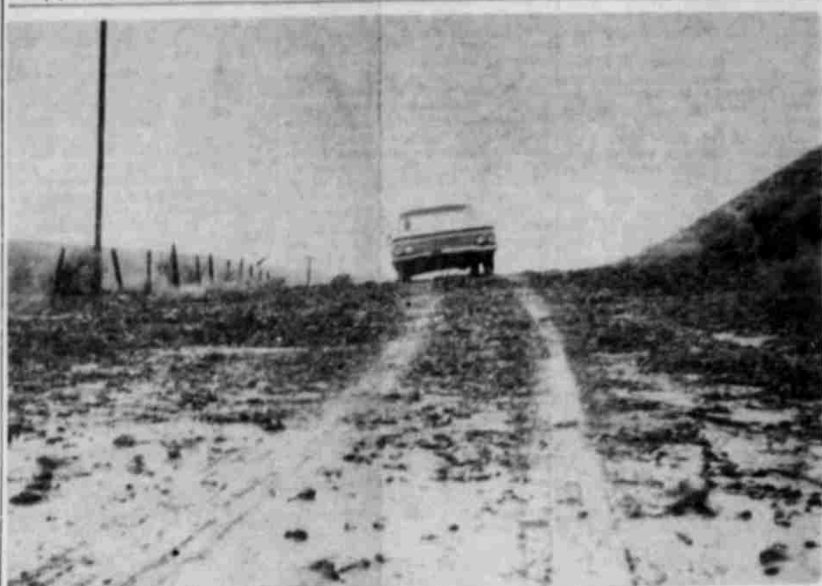
DAMAGE to county roads was of many different types in recent floods. Washouts were the most damaging, but in the instance pictured above on the Lower Rhea Creek road, tons of rock have been washed on to the road to depth of three or four feet, posing a big job of removal.

Heppner, Oregon, Thursday, January 7, 1965 Sec. 2 - 4 pages