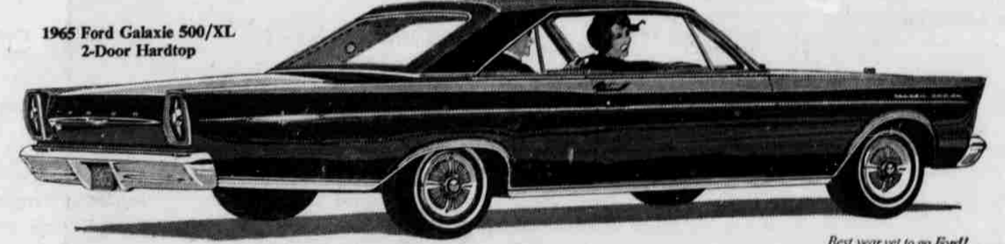
New ultra-luxurious Ford LTD has quilted nylon-and-vinyl upholstery, thick cut-pile carpeting, rich walnut-like paneling in doors and instrument panel, and (like all Fords) —spaciousness. Even more hip, shoulder, knee room than last year.