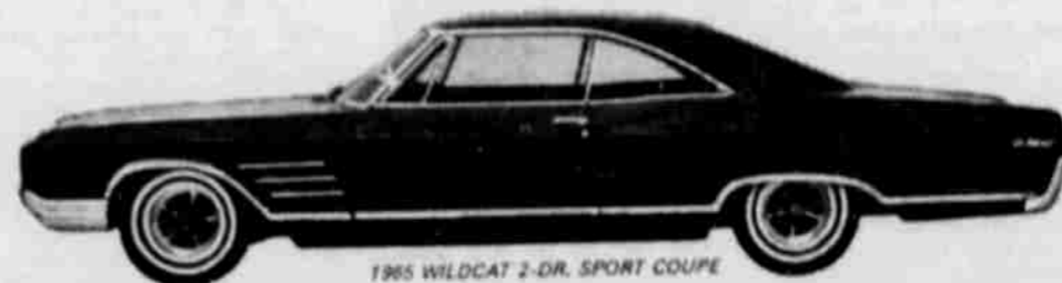
1965 WILDCAT 2-DR. SPORT COUPE

Good news for patient people. The '65 Buicks are in production again. And lots of new Buicks are on their way to us. Help us send your favorite on its way to you. Come in and order the Buick you want.