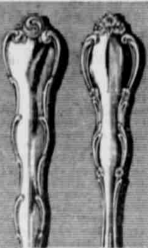
Woods $33.75 Moss Tiera $33.75

FOR A MERE 33¢ PER WEEK PER PLACE-SETTING! NO DOWN PAYMENT! NO CARRYING CHARGE!