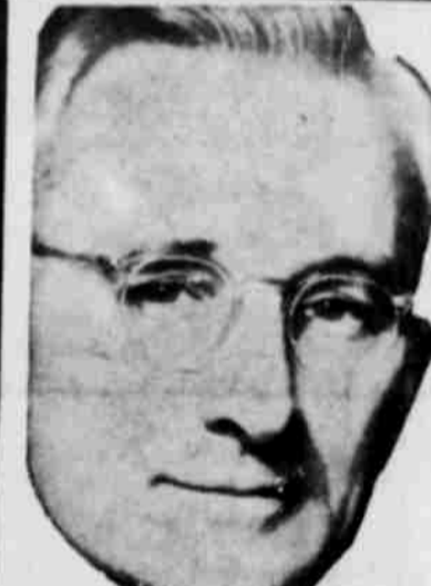
DALE CARNEGIE, author of "How to Win Friends and Influence People," "How to Stop Worrying and Start Living."

virgin Acrylic electric blanket reg. $15 NOW $11.88 single control twin or full size 72"x84" twin size 63"x84" The famous blanket used by over a million happy sleepers! Extra soft, fluffy with Supnap. Dial the warmth you like. Nylon binding. Snap-fit corners. Machine wash, lukewarm water. pink cloud . rosebeige . peacock . bright lavender . avocado . honey gold . raspberry ice . copen blue . orange ice . more! virgin Acrylic electric blanket reg. $21 NOW $16.88 dual control double bed size 80" x 84" Luxury at dollars less than you'd expect. Downy virgin acrylic, superbly light, beautifully machine washable (lukewarm water). Dial your favorite warmth. Nylon satin binding. Snap-fit corners. pink cloud . deep lavender . peacock . curry . bright olive . chocolata . vivid blue . wild rose . rosebeige . yellow. *Should defects in material or workmanship develop we will replace the control for 5 years; we will replace the blanket for 2 years, repair it for 3 years.