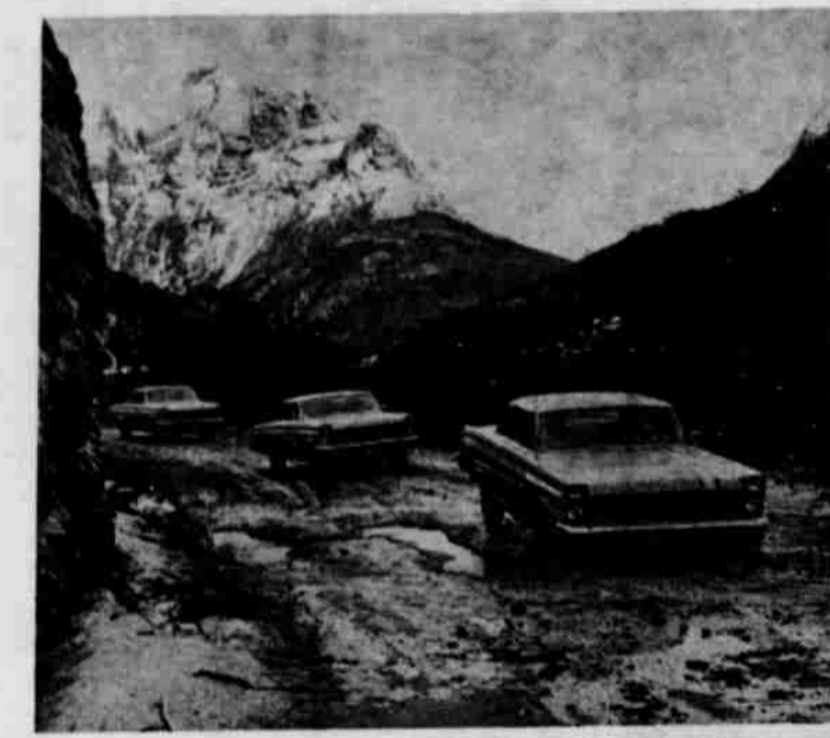
Shades of Daytional Comet is famous for durability. Last year, specially equipped Comets ran 100,000 miles at Daytona in 40 days.

Regular production-model Comets used, just like showroom Comets. Want to see the car that made it from Cape Horn to Fairbanks? Visit your Mercury dealer's. Check a 1965 Comet Caliente, with smooth Multi-Drive Merc-O-Matic. The only difference: the run cars had an extra gas tank, because service stations are frequently so far apart in South America.