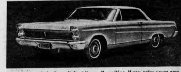
Comets are ready for immediate delivery. No waiting, if you order yours now.

Regular production-model Comets used, just like showroom Comets. Want to see the car that made it from Cape Horn to Fairbanks? Visit your Mercury dealer's. Check a 1965 Comet Caliente, with smooth Multi-Drive Merc-O-Matic. The only difference: the run cars had an extra gas tank, because service stations are frequently so far apart in South America.