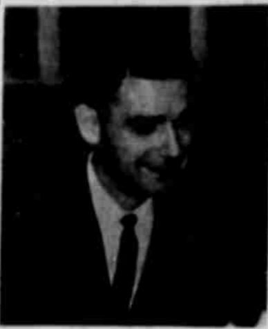
GOVERNOR MARK HATFIELD