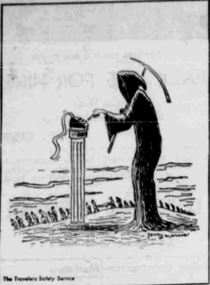
The Travelers Safety Service

42,700 persons died in highway accidents in 1963.