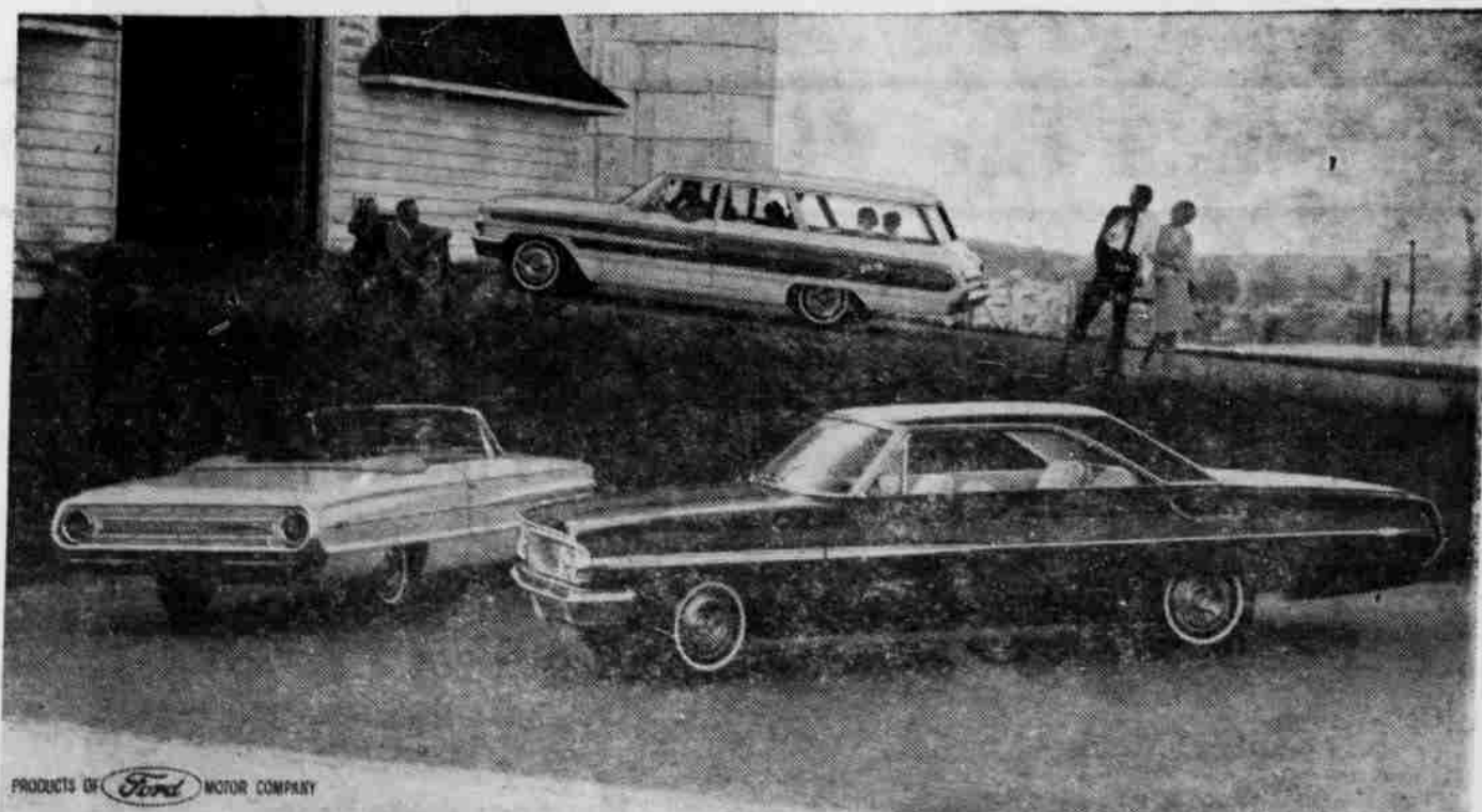
Left to right: Ford Galaxie 500/XL Convertible, Ford Country Squire, Ford Galaxie 500/XL Hardtop

Mustang • Falcon • Fairlane • Ford • Thunderbird