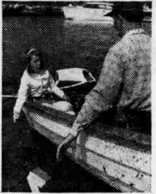
every litter bit hurts!"