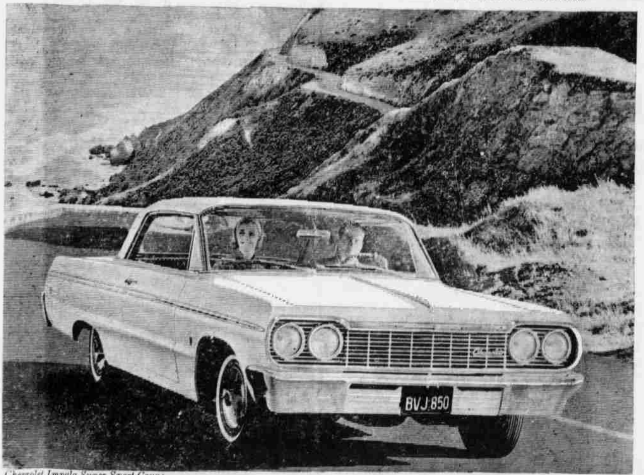
Chevrolet Impala Super Sport Coupe CHECK THE T-N-T DEALS ON CHEVROLET • CHEVELLE • CHEVY II • CORVAIR AND CORVETTE NOW AT YOUR CHEVROLET DEALER'S

All seven Chevrolet engines are precision balanced for smooth operation. And because your Chevrolet has over 700 insulators and sound deadeners, you don't have to shout to have yourself heard. It's Trade 'N' Travel Time at your Chevrolet dealer's—the perfect time to try the Jet-smooth ride. Find the meanest stretch of road you can. Then see for yourself how straight a crooked road can feel.