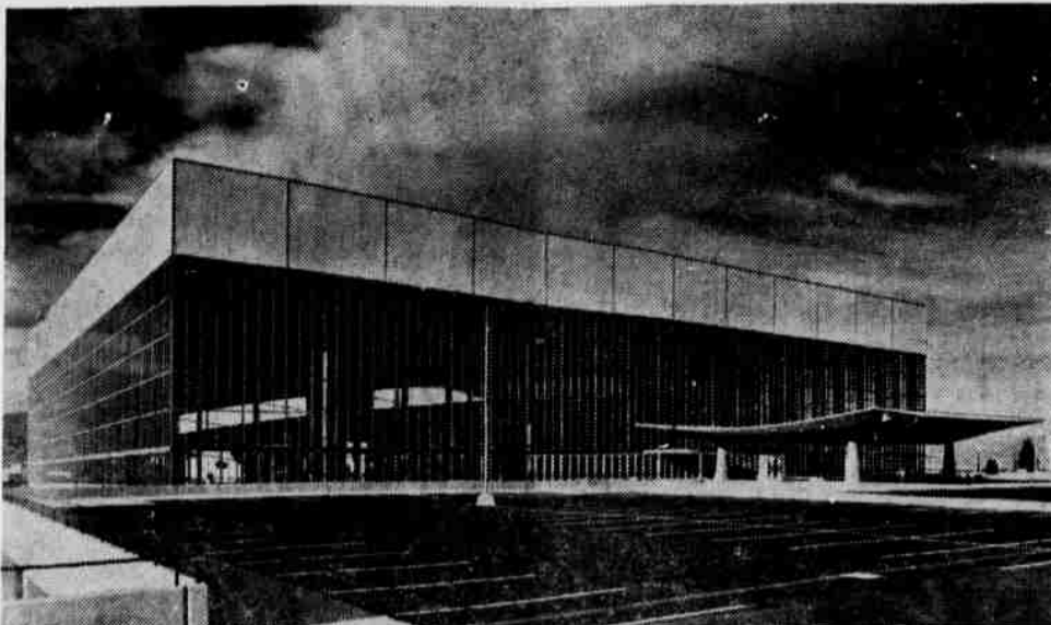
Portland's Memorial Coliseum will be the scene of the first annual Portland Rose Music Festival, to be held June 10, 11 and 12 as a highlight of the 1964 Rose Festival. College and high school-age students from all parts of the Pacific Northwest will be eligible to participate and to compete for scholarships.